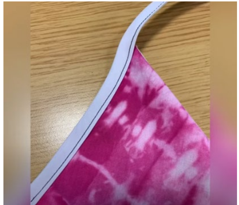
Bunting flags – YouTube