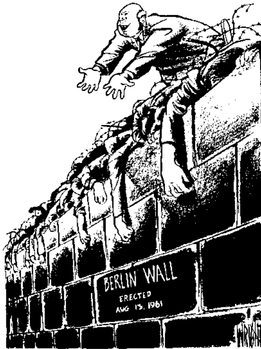
Don Wright. The Miami News , 1961.

What do you NOT know about this picture?