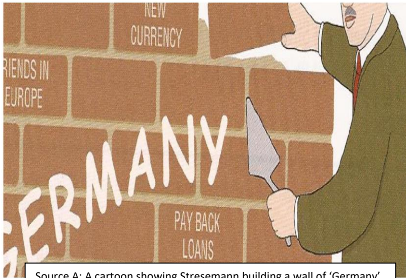
Source A: A cartoon showing Stresemann building a wall of 'Germany' using new currency, loans, friends in Europe as the 'bricks'.