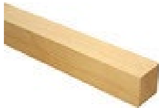
45mm x 45mm pine wood