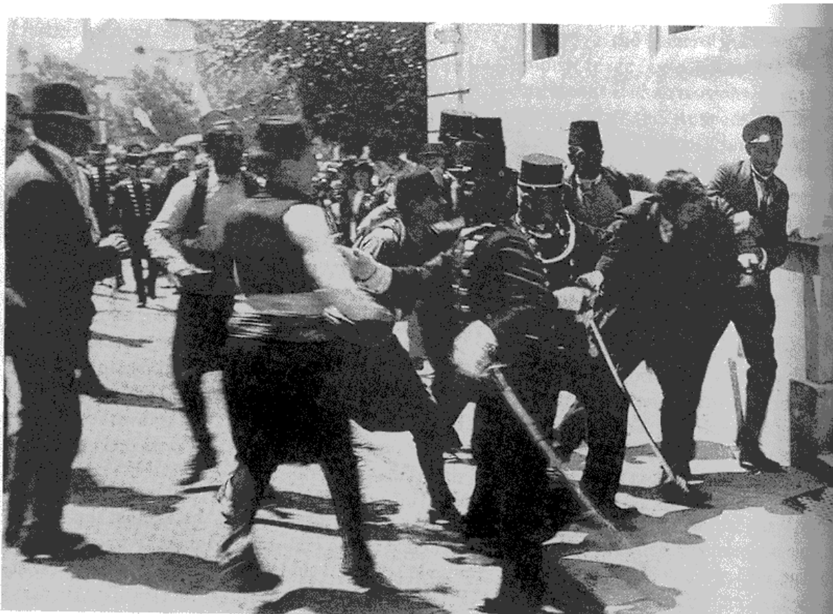
Gavrilo Princip is seized by police, moments after mortally wounding Archduke Francis Ferdinand and his wife.